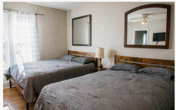
ONE OF THE UPSTAIRS BEDROOMS AT SERENITY HOUSE