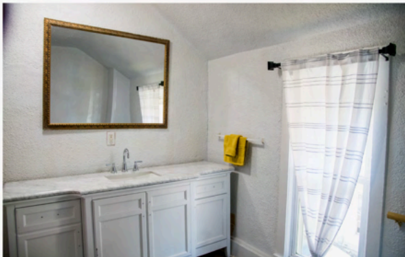
UPSTAIRS BATHROOM REMODELED FOR RESIDENTS AT SERENITY HOUSE