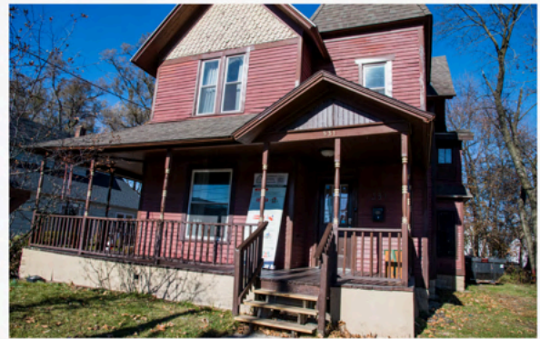
SERENITY HOUSE LOCATED AT 531 BRYANT STREET IN KALAMAZOO'S EDISON NEIGHBORHOOD.